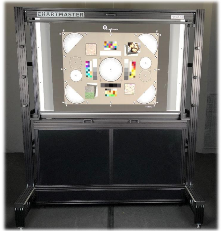
CHARTMASTER: Chart changer for up to 11 charts

NomiCam CHARTMASTER is designed to save time and safeguard the test charts. Switching of the charts takes about 15 seconds. No need to re-adjust the illumination and focus distance as the camera-to-chart distance is preserved. CHARTMASTER includes a convenient and protected storage for up to eleven test charts. CHARTMASTER significantly reduces risk of damaging the test charts. CHARTMASTER fits through normal doors and the compact size enables easy space management for the test lab.