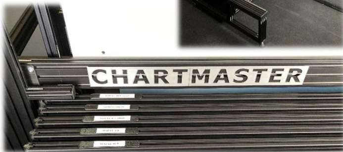
Chart storage for 11 charts